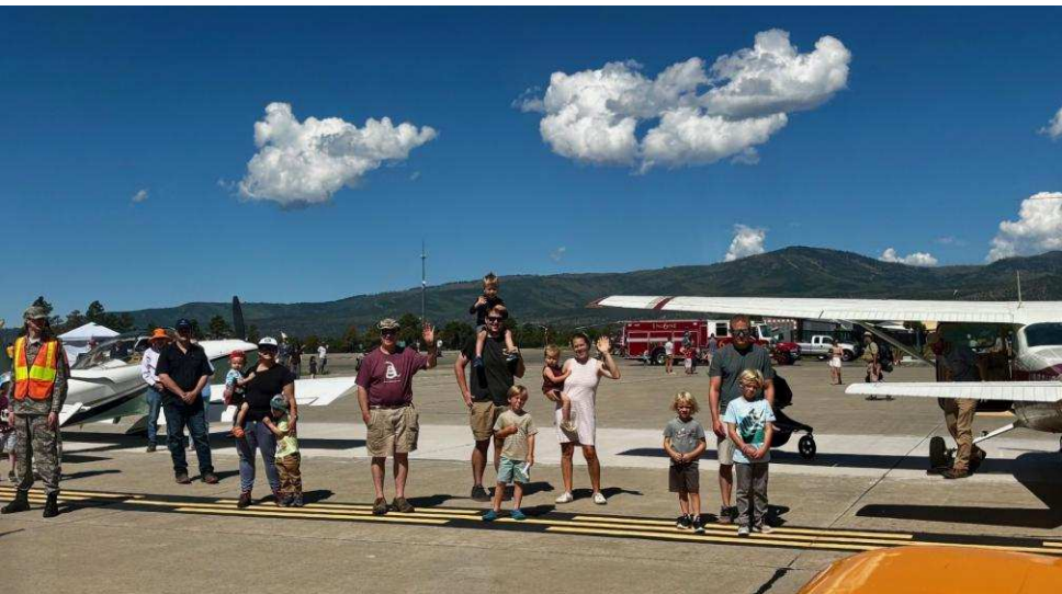
Crowd seeing off departures

NMPA encourages you to work with your airport community leaders to host an event at your airport.