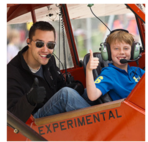
Young Eagles is all about free airplane rides for kids.

families in town these days with all the Lab hiring going on, so I think we will have plenty of customers.